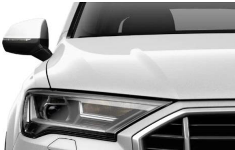
Headlamps with LED rear combination lamps (standard)