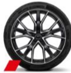
Audi Sport cast alloy wheels, 5-spoke star style, Black, diamond-turned, 10J x 22 with 285/35 R22 tires