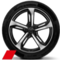
Audi Sport cast alloy wheels, 5-spoke blade style, Black, diamond-turned, 9.5J x 21 with 285/40 R21 tires