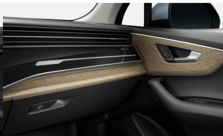
Inlays wood eucalyptus natural