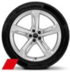
Audi Sport cast alloy wheels, 5-spoke blade style, 9.5J x 21 with 285/40 R21 tires