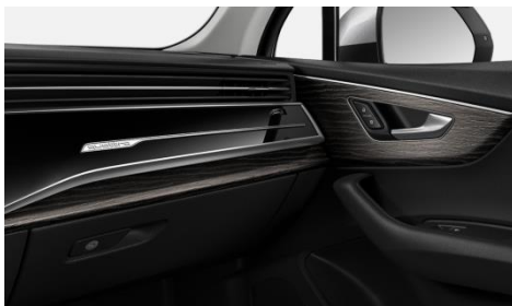
Decorative inserts in Gray Brown Natural Fine Grain Ash