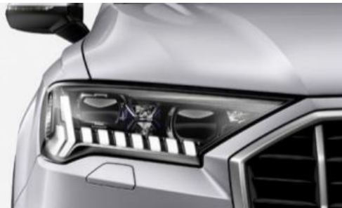
HD Matrix LED headlamps with Audi laser light and LED rear combination lamps and headlamp washer system