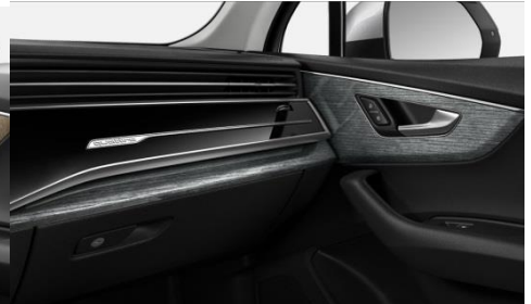
Inlays wood oak